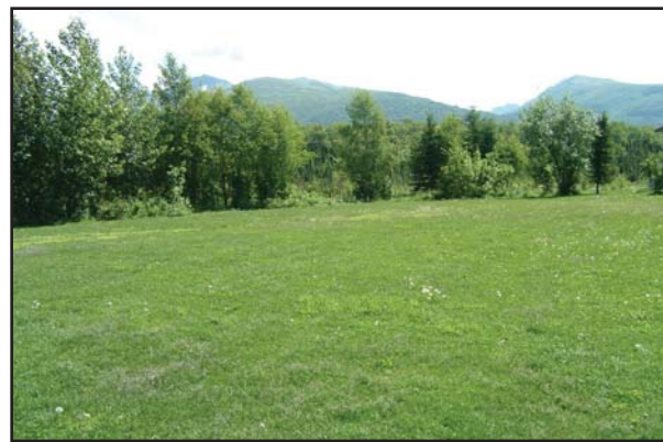
Improved maintenance of overgrown green areas is needed

For a complete directory of Report Card results for neighborhood parks, go to www.AnchorageParkFoundation.org/projects/reportcard.htm