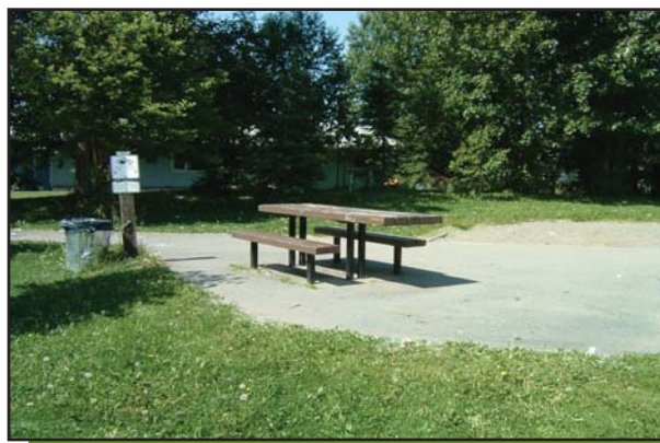
Park users requested more picnic tables