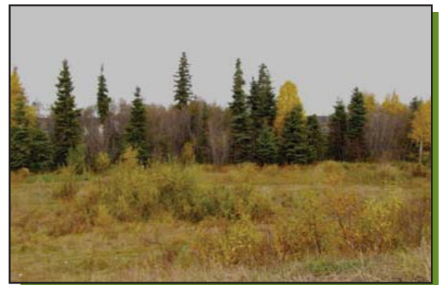
Users would also like to see trail upgrades

For a complete directory of Report Card results for neighborhood parks, go to www.AnchorageParkFoundation.org/projects/reportcard.htm