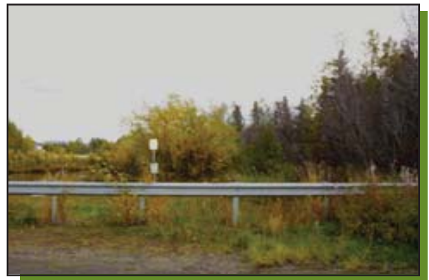
Improved sight lines are needed for user safety

Participants in Meadow Park identified many problems limiting the functionality of the park. Thickly forested green areas limit visibility, making park users feel unsafe, and the soft-surface trails are in poor condition. Additionally, there are very few benches or tables. Finally, the parking lot is rutted and muddy, and there are inadequate signs to inform visitors of park uses.