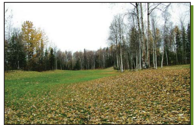
Informational signs about birch-stripping are needed in Oceanview Park

For a complete directory of Report Card results for neighborhood parks, go to www.AnchorageParkFoundation.org/projects/reportcard.htm