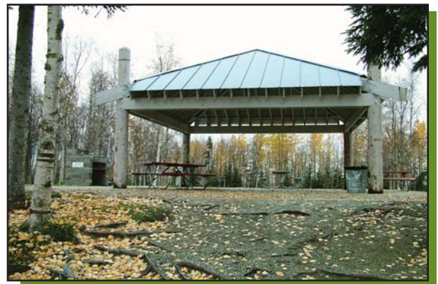
The neighborhood would like to see grill cleaned or replaced