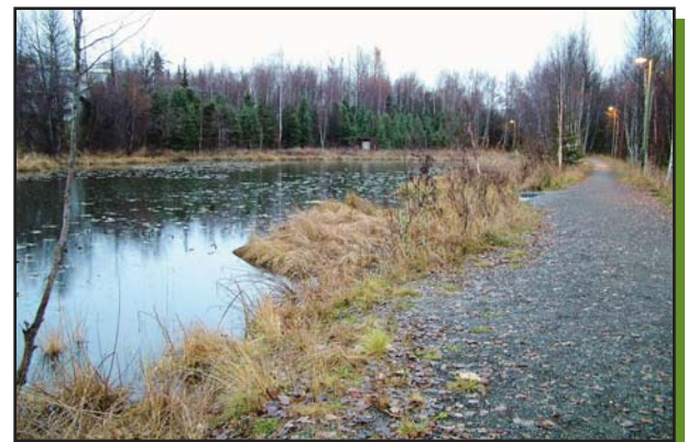
Litter in the pond is also a problem

For a complete directory of Report Card results for neighborhood parks, go to www.AnchorageParkFoundation.org/projects/reportcard.htm