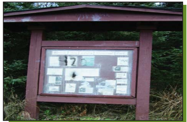
The neighborhood is concerned about usefulness of the kiosk in the park