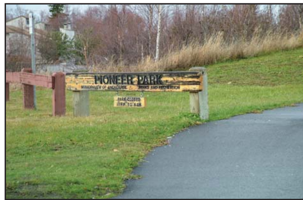
The park sign is in need of repairs

For a complete directory of Report Card results for neighborhood parks, go to www.AnchorageParkFoundation.org/projects/reportcard.htm