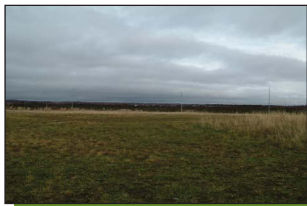
The neighborhood is concerned about the quality of the mowing in Pioneer Park