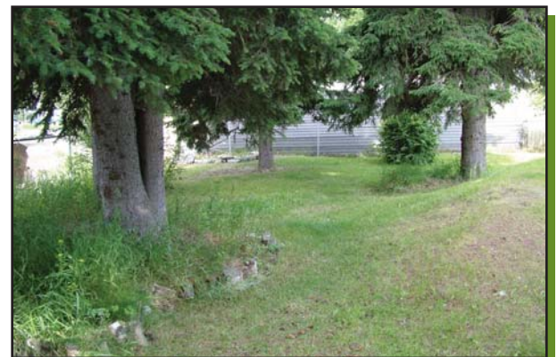
Neighbors requested improvements to visibility within the park

For a complete directory of Report Card results for neighborhood parks, go to www.AnchorageParkFoundation.org/projects/reportcard.htm