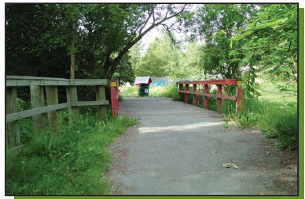
The "Red Bridge" is in need of repair

Report Card participants in Red Bridge Park identified many safety concerns, such as broken pieces of the "Red Bridge", high traffic speeds in the surrounding neighborhood and inadequate safety surface material in the play area. Also, the benches are run-down and unattractive, and there are litter problems throughout.