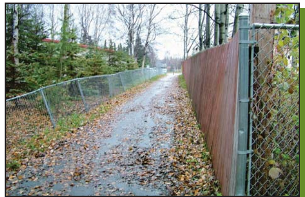
The neighborhood is concerned about the safety of pathways in Sand Lake Park