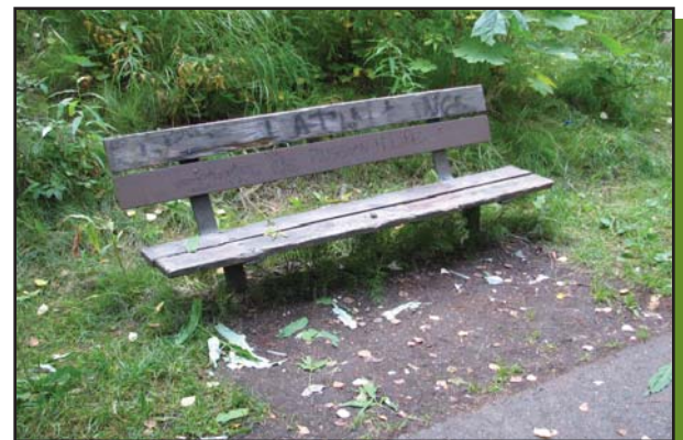
Benches are in need of repair or replacement

For a complete directory of Report Card results for neighborhood parks, go to www.AnchorageParkFoundation.org/projects/reportcard.htm