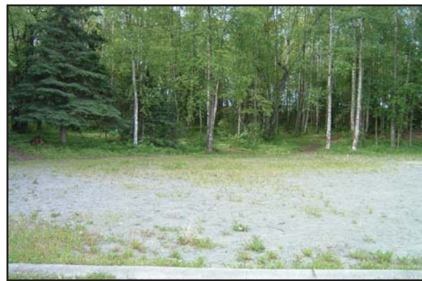
Improved sight lines are needed for user safety

For a complete directory of Report Card results for neighborhood parks, go to www.AnchorageParkFoundation.org/projects/reportcard.htm