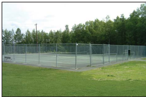
Neighbors would like repairs to the tennis court

The primary concerns for volunteers at Scenic Park were inadequate play equipment, dirty and worn seating areas, and overgrown green spaces that occasionally blocked access to trails. Where green areas are thickly forested, park visitors often do not feel safe due to the poor sight lines. The tennis courts at Scenic Park also need resurfacing and repainting.