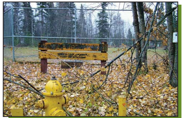
The neighborhood is concerned about the appearance of the park outer edge