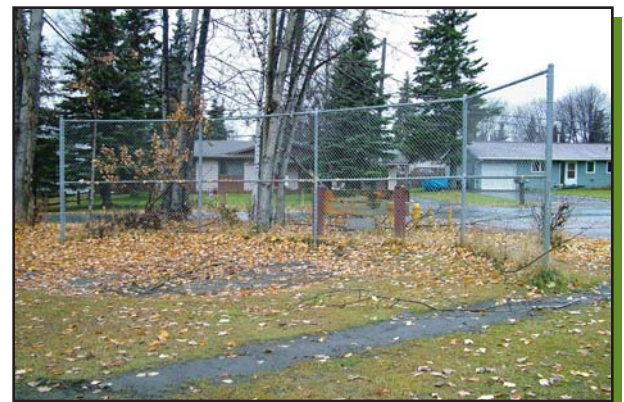
The ballfield is in need of repairs

For a complete directory of Report Card results for neighborhood parks, go to www.AnchorageParkFoundation.org/projects/reportcard.htm