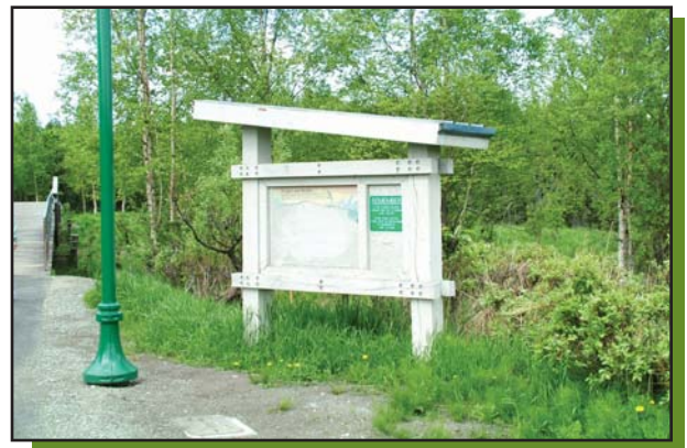
The neighborhood is concerned about poor signage

Community members reported seeing unsafe activities in Sitka Park during night hours and requested that the park gate should be closed when the park is closed. Additionally, volunteers were concerned about debris and standing water blocking trails and the lack of a volleyball net in the court. Participants also requested the addition of informational signage and a dog station.