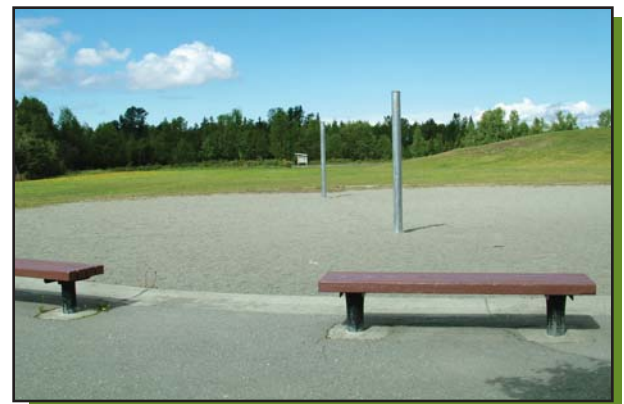
A net is needed in the volleyball court

For a complete directory of Report Card results for neighborhood parks, go to www.AnchorageParkFoundation.org/projects/reportcard.htm