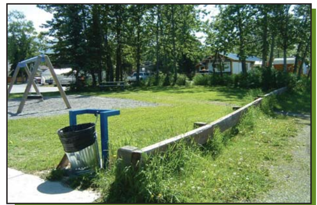
Needed upgrades include the park entry area

For a complete directory of Report Card results for neighborhood parks, go to www.AnchorageParkFoundation.org/projects/reportcard.htm