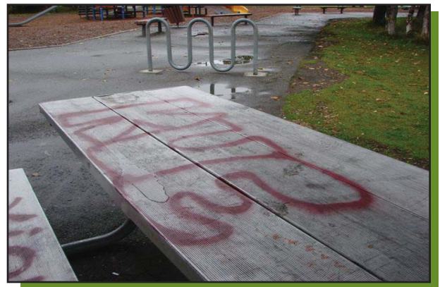
The neighborhood is concerned about graffiti

Participants were extremely concerned about visitor safety in Standish Park, focusing specifically on poor maintenance, broken benches and tables, litter, evidence of inappropriate activities and extensive graffiti throughout the park. Additionally, bollards are rotted and missing altogether in places, allowing people to drive vehicles into the park.