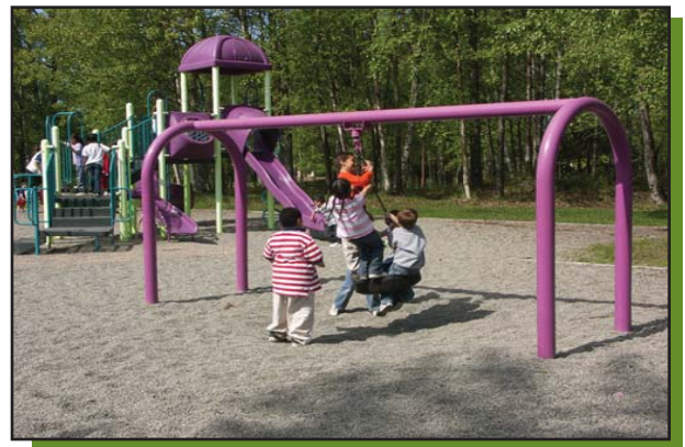
Additional swings are needed in the play area

Community members reported concerns about unsafe activities occurring in Sunset Park during night hours; some participants were particularly concerned about people driving their vehicles into the park and damaging lawns and equipment. Community members also noted insufficient play equipment, poor maintenance of lawn areas and the sledding hill and insufficient trash cans.