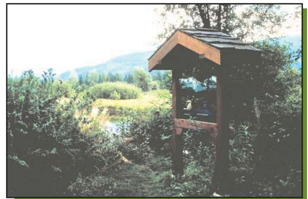
Neighbors suggested the addition of informational signs about historic features

For a complete directory of Report Card results for neighborhood parks, go to www.AnchorageParkFoundation.org/projects/reportcard.htm