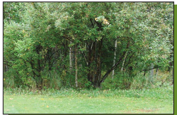
The neighborhood is concerned about visibility within the park

Report Card participants in Suzan Nightingale McKay Park identified overgrown trees and brush blocking scenic views as well as trails through the park. Additionally, repairs are needed in the play area, where there is broken equipment, loose safety matting and insufficient sand. Finally, participants noted that the dog station is not accessible to all park users.