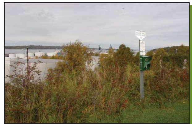
Additional dog stations are needed for park users

For a complete directory of Report Card results for neighborhood parks, go to www.AnchorageParkFoundation.org/projects/reportcard.htm