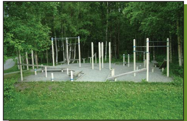
Participants identified broken fitness equipment

Participants in Taku Lake Park identified a variety of concerns. In the play area, wooden equipment is splintering where paint is missing. Lawns are patchy and muddy, trees and brush are overgrown, the fishing dock, fitness cluster and tennis courts are unusable and there are only two tables. The parking lot is uneven and cracked and informational signs are poorly visible and unattractive.