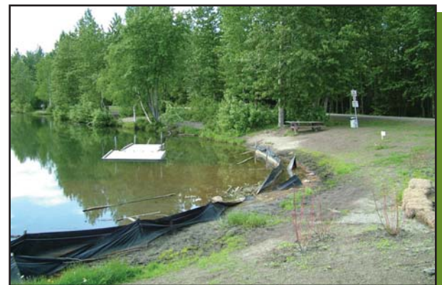
The fishing dock is broken and unusable

For a complete directory of Report Card results for neighborhood parks, go to www.AnchorageParkFoundation.org/projects/reportcard.htm