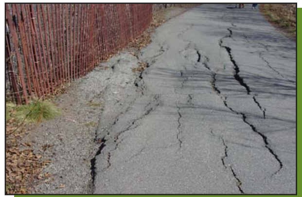
Neighbors are concerned about the poor condition of pathways inside the park