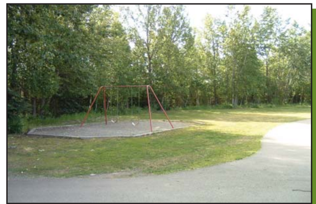
Neighbors requested an upgrade to the play equipment

For a complete directory of Report Card results for neighborhood parks, go to www.AnchorageParkFoundation.org/projects/reportcard.htm