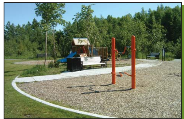
More wood chips are needed for safety cushioning in the play area

For a complete directory of Report Card results for neighborhood parks, go to www.AnchorageParkFoundation.org/projects/reportcard.htm