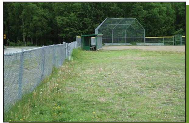
The neighborhood is concerned about drainage in the ballfield