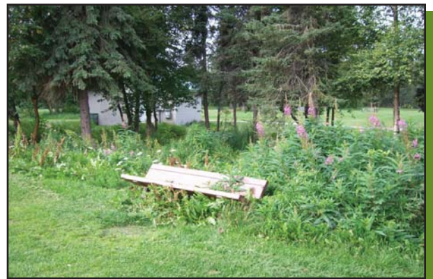
Neighbors are concerned about the condition of amenities like benches