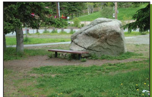
The lawn areas need improvements

For a complete directory of Report Card results for neighborhood parks, go to www.AnchorageParkFoundation.org/projects/reportcard.htm