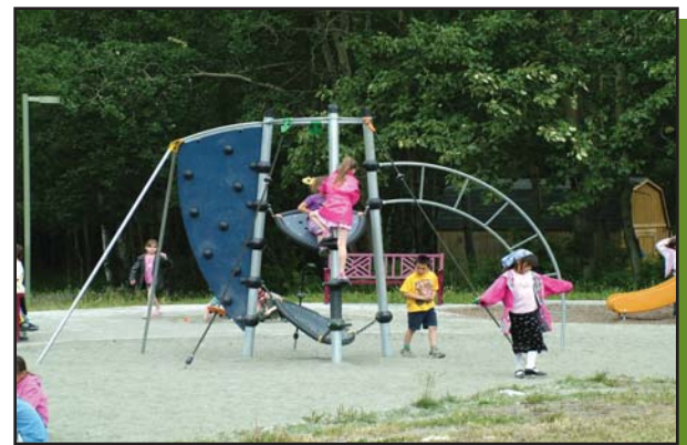
Repairs are needed to the climbing wall

For a complete directory of Report Card results for neighborhood parks, go to www.AnchorageParkFoundation.org/projects/reportcard.htm