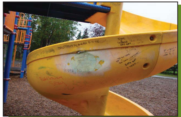
Neighbors are concerned about the play equipment safety