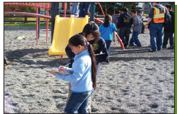
Students were concerned about playground safety

For a complete directory of Report Card results for neighborhood parks, go to www.AnchorageParkFoundation.org/projects/reportcard.htm