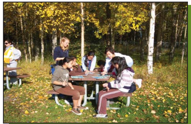
Local schoolchildren graded the playgrounds at Duldida Park and William B. Lyons Park