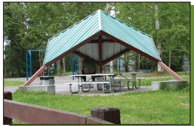
More picnic facilities are needed in Wilson Park

Community members reported concerns about unsafe activities occurring in Wilson Park during night hours, as well as extensive litter left by nighttime users. Also, there are no tot swings in the play area. Community members reported that it is a popular park and would receive even more use from the neighborhood if there were grills and picnic tables.