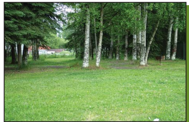
Improved sight lines are needed for user safety

For a complete directory of Report Card results for neighborhood parks, go to www.AnchorageParkFoundation.org/projects/reportcard.htm