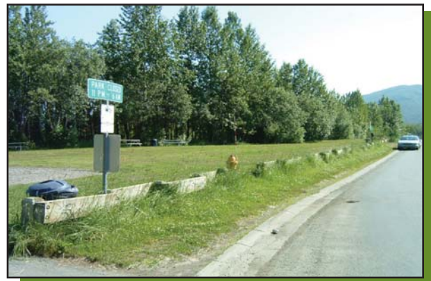
Neighbors are concerned about the park entry appearance