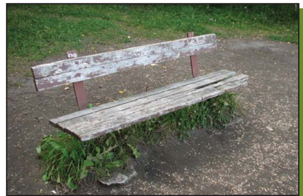
Graffiti is a problem throughout the park

For a complete directory of Report Card results for neighborhood parks, go to www.AnchorageParkFoundation.org/projects/reportcard.htm