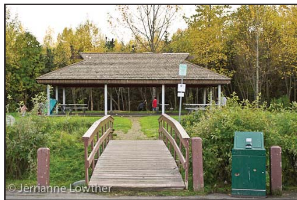
Picnic shelter with tables, bear resistant trash containers. Bridge & bollards need repainting.

For a complete directory of Report Card results for neighborhood parks, go to www.AnchorageParkFoundation.org/projects/reportcard.htm