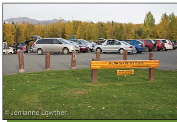
Bollards need to be re-painted