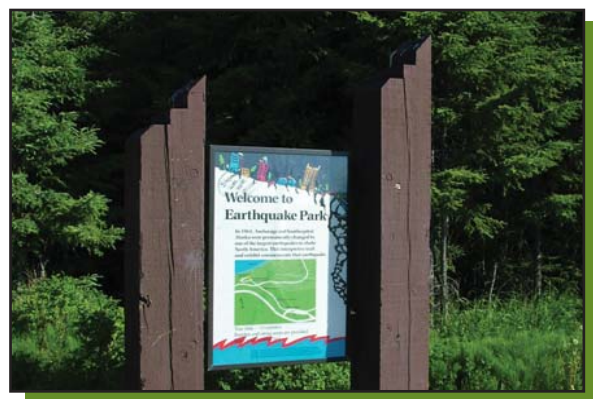
Interpretive sign covered in graffiti and bullet holes- needs to be replaced.