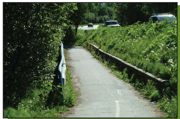
Coastal trail overgrown with weeds

For a complete directory of Report Card results for neighborhood parks, go to www.AnchorageParkFoundation.org/projects/reportcard.htm