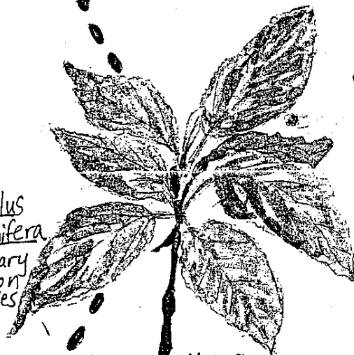
Young poplars at the Glacier Face

abrasion of limestone reminds us of the scouring ice nearby