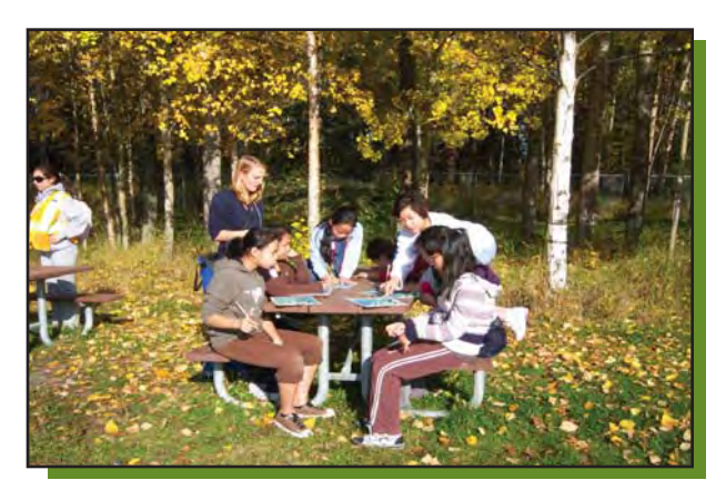
Local schoolchildren graded the playgrounds at Duldida Park and William B. Lyons Park