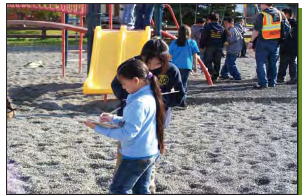
Students were concerned about playground safety

For a complete directory of Report Card results for neighborhood parks, go to www.AnchorageParkFoundation.org/projects/reportcard.htm