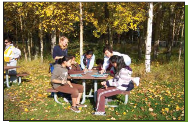
Local schoolchildren graded the playgrounds at Duldida Park and William B. Lyons Park