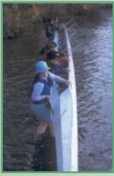
Challenge Grantee Anchorage Rowing Club beach launching