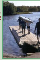
New dock purchased with a challenge grant match. Dry rowers!