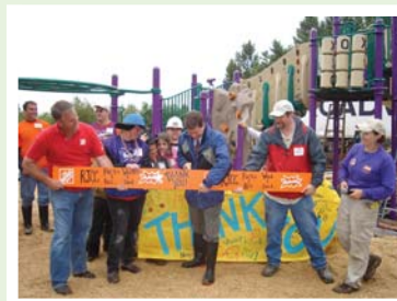
Williwaw Park after