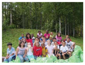
Weed Warriors in action

Clean & Green, Safe & Secure -- Volunteers log 12,601 hours improving parks & trails in 2006