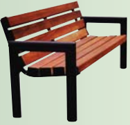
Benches and park furniture for placement in 18 parks throughout Anchorage