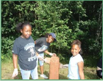
Volunteers paint bollards at Tikishla Park