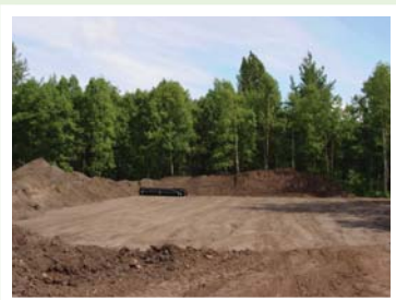
Williwaw Park before

June 22 2006, 250 volunteers build Williwaw Park playground in one day