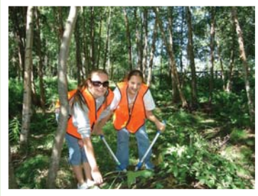
Safe & Secure on the Chester Creek Trail