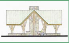
Abbott Loop Community Park Picnic Pavilion (under construction)