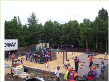
Williwaw Park during