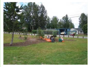
TREerific maintaining treescape at Turpin Park