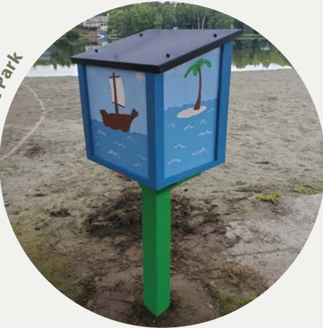
Jewel Lake Park