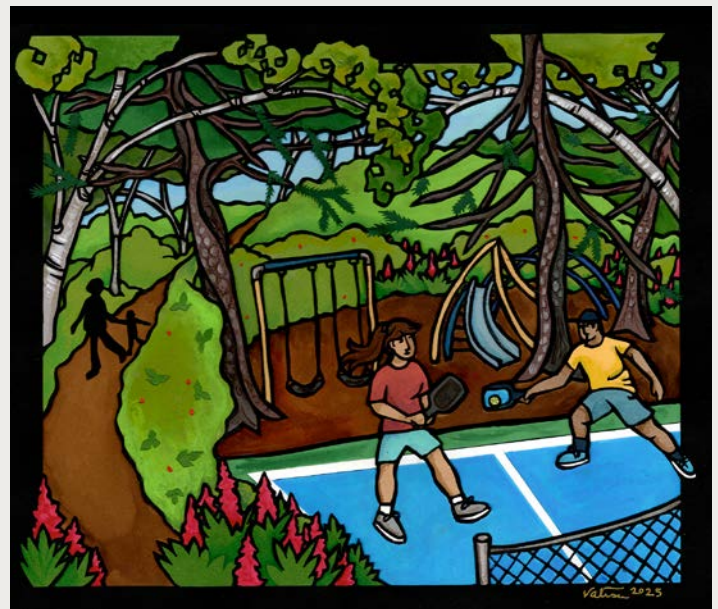
Scenic Park by Valisa Higman

Through the arduous work of neighborhood volunteers, Scenic Park has transformed into a vibrant hub. With its inclusive atmosphere, scenic views, and newly renovated facilities, it is wonderful to recognize this community treasure.